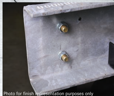
Photo for finish representation purposes only